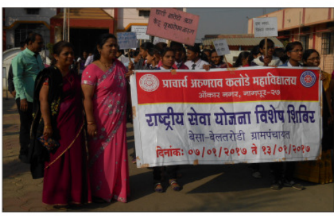
राष्ट्रीय सेवा योजना विशेष शिबिराचे आयोजन